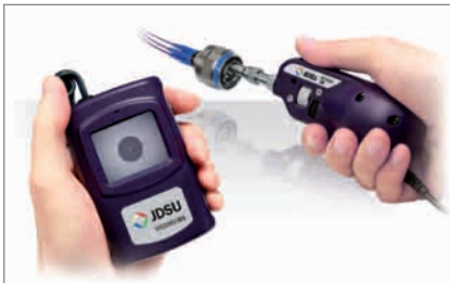
ELIO® Fiber Optic Visual Inspection Tool

SOURIAU and JDSU teamed to develop a contact end face inspection tool to inspect ELIO® singlemode and multimode harnesses.