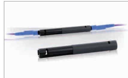
ELIO® Mechanical Splice

ELIO® sealed contacts terminated with the ELIO® cabling kit and connected through the ELIO® mechanical sleeve is a reliable and sealed solution to repair damaged optical links.